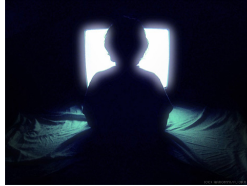
watch, to look